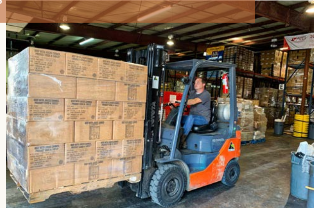
The National Guard helped the Food Bank of Central Louisiana package and deliver food to families struggling during the coronavirus pandemic.

T he Rapides Foundation in April awarded grants totaling $400,000 to two agencies working to provide relief and assistance to Central Louisiana residents whose lives have been impacted by the coronavirus pandemic.