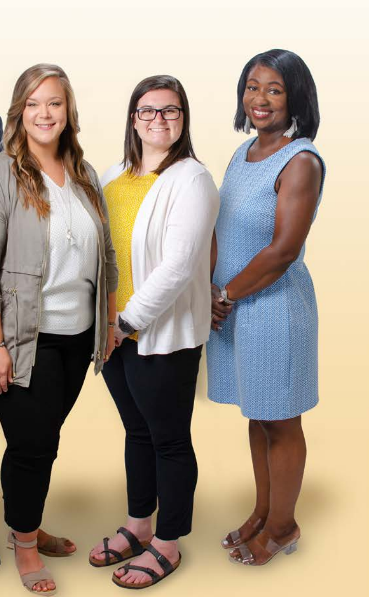
COHORT 1 | 2019-2020

N ine individuals from Central Louisiana have completed an intense, 15-month teacher residency program and are now beginning their careers as middle-school math and science teachers.